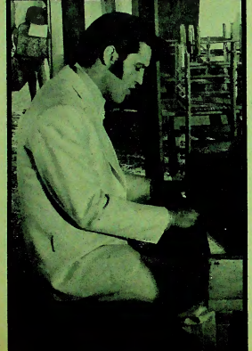
THE MAN WHO DISCOVERED DYLAN

CARNABY ST. W.1. GER · 8090 RECORD MIRROR EVERY THURSDAY