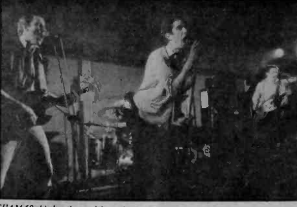
SHAM 69: hitting the road from this week

ties, Paddington (01-733 0885), Itotline LONDON, White Hart, Tottenham (01-808 8751), Gina & The Rockin