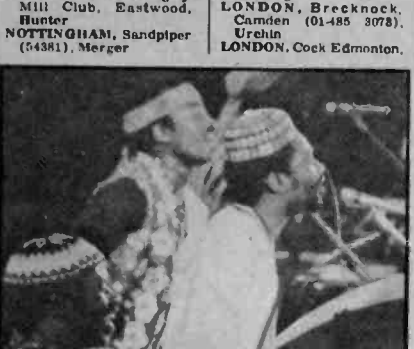
OSIBISA: Aylesbury Friars, Saturday

The Dogs LONDON, Brecknock, Camden (01-485 3078).