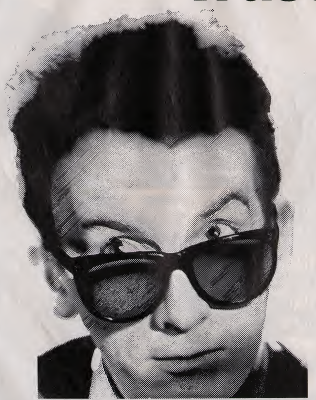
ELVIS COSTELLO and the ATTRACTIONS. XXLP11