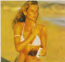
This, apparently, is a "sure thing". (Funny - I could have sworn it was a sexual picture of a "chick" - Ed )